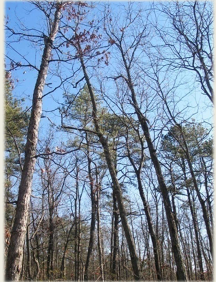
Woodlands on the 78 acre Great Egg Harbor Greenway property Winslow Township, Camden County