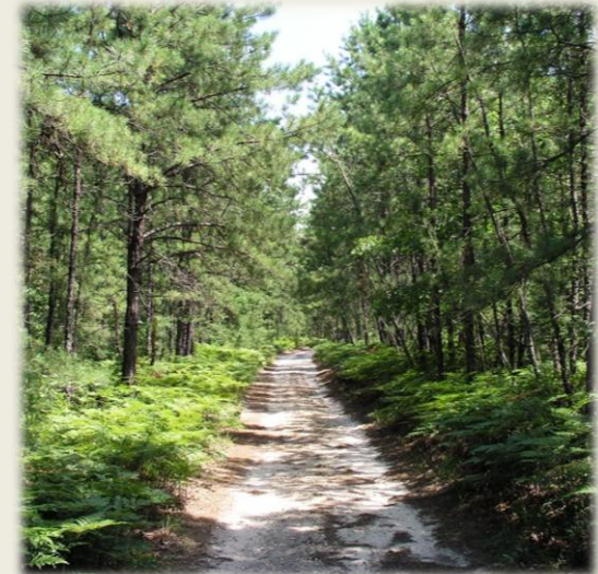
Above: Conectiv transmission line through forested area Below: Trail on 699 acre Cologne Avenue property