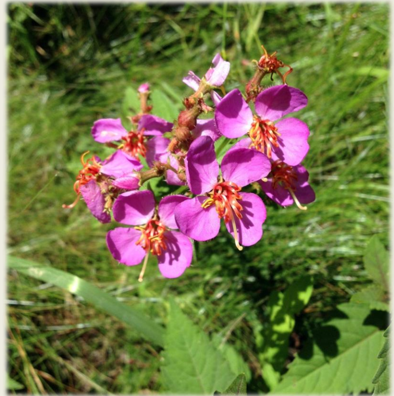
Meadowbeauty on the 2,762 acre Lenape Farms property