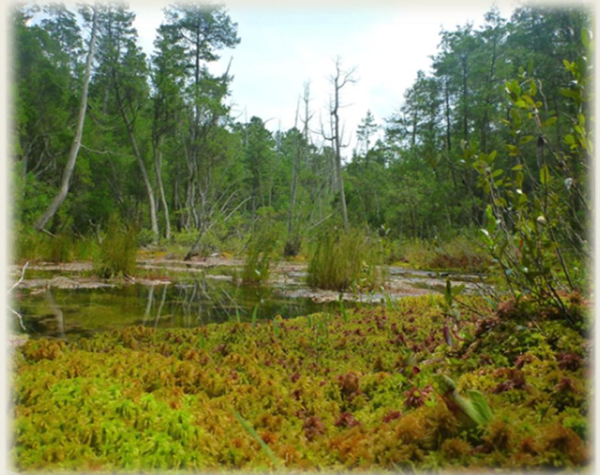
Mossy wetland on the 473 acre Zemel property Woodland Township, Burlington County