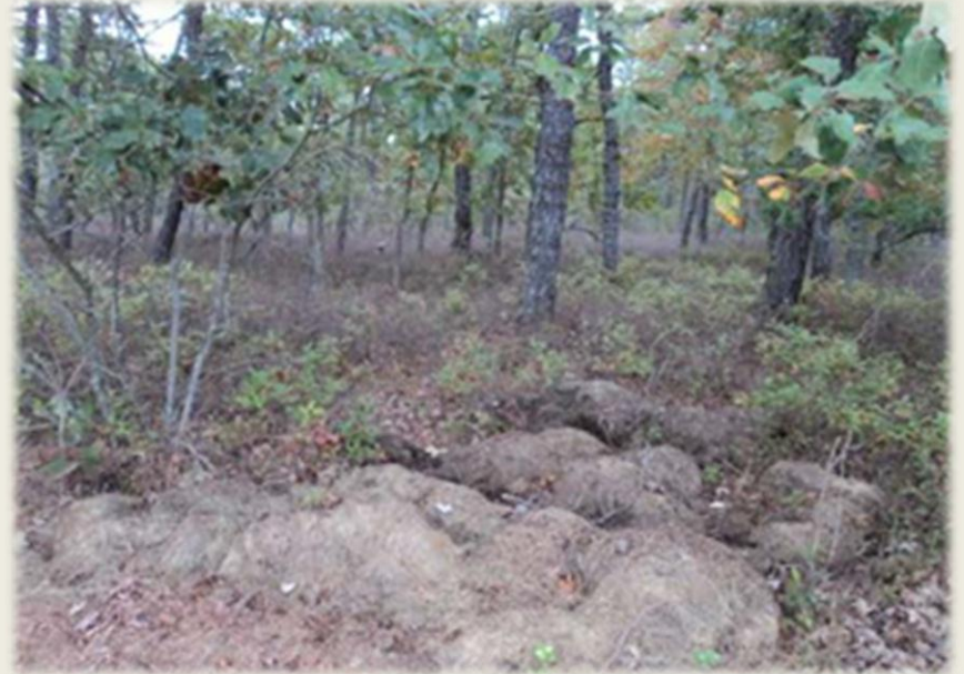
Woodland on the 11 acre Urquhart property Ocean Township, Ocean County