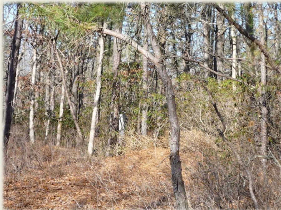
Woodlands on the 237 acre Barnegat Hills property Ocean Township, Ocean County