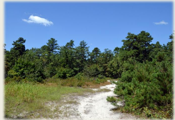
Above: Garden State Parkway widening construction Below: Sandy opening on the 75 acre Maple Root River property