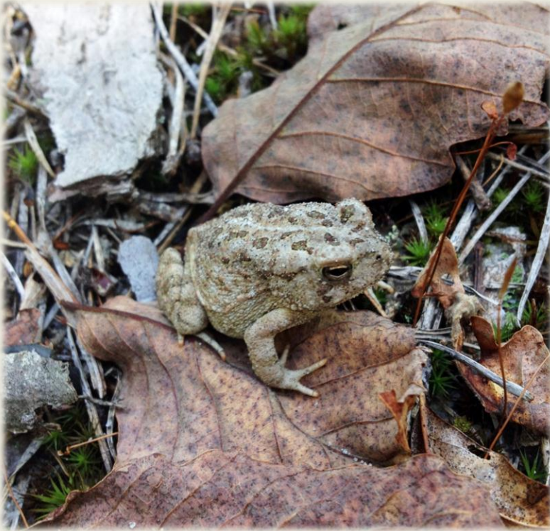
Fowler's toad on the 75 acre Maple Root River property Jackson Township, Ocean County