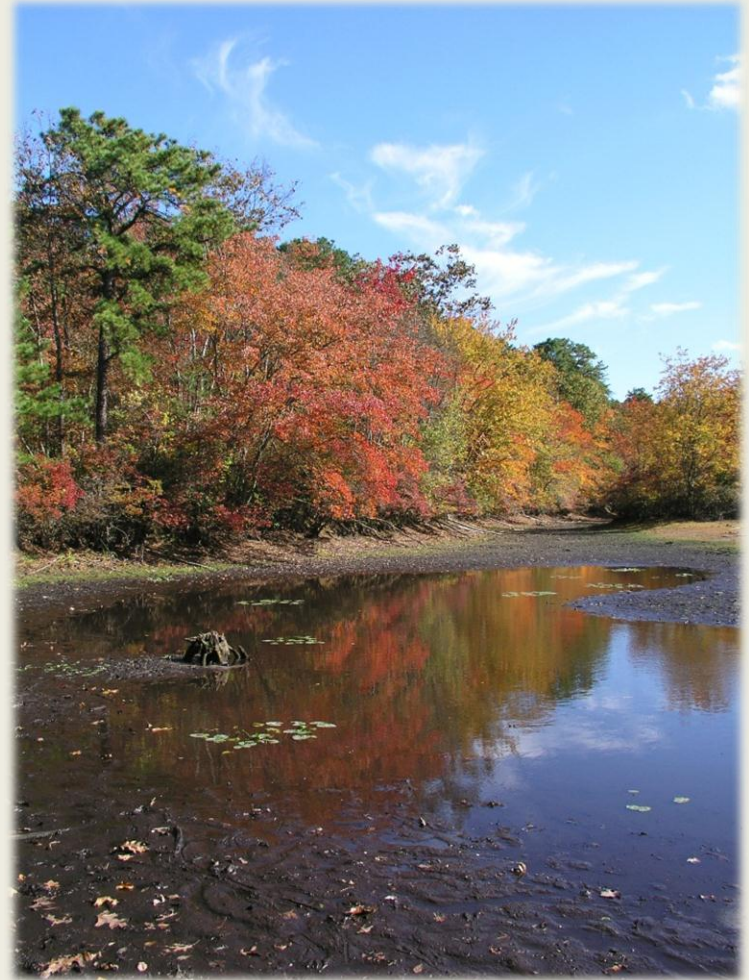
Autumn view of the 203 acre Wollman property Medford & Shamong townships, Burlington County