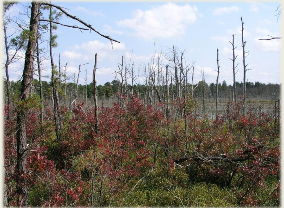
The 163 acre Jackson Land LLC property in the Toms River Corridor Jackson Township, Ocean County