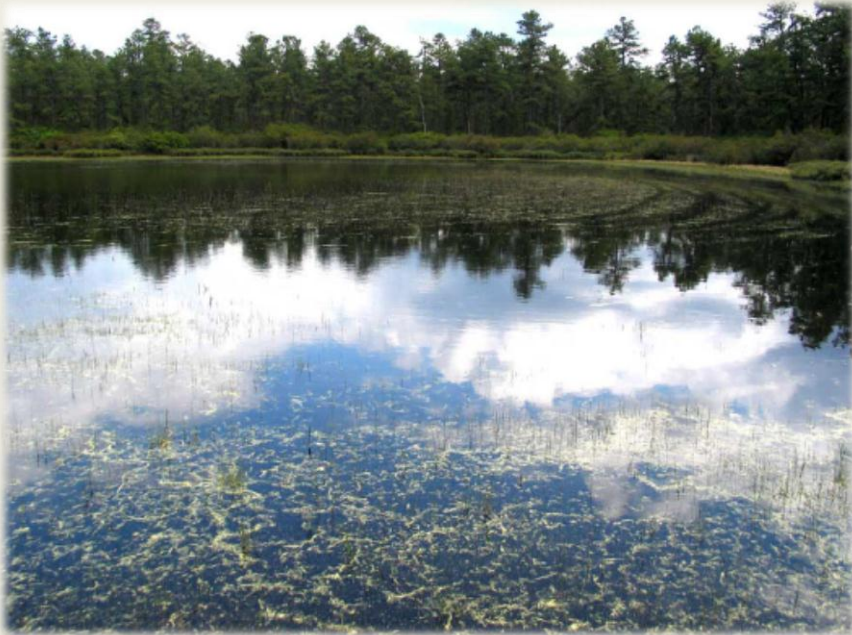
Pond on the 107 acre Oswego Gun Club property Bass River Township, Burlington County