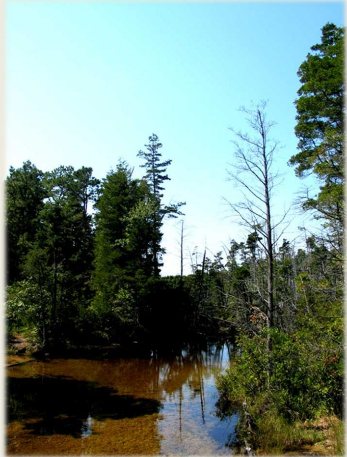
Oyster Creek on the 887 acre Horner property Ocean Township, Ocean County