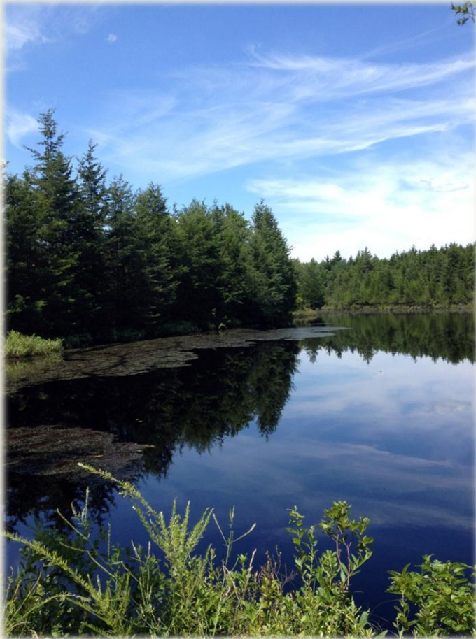
Headwaters of the Great Egg Harbor River on the 2,762 acre Lenape Farms property