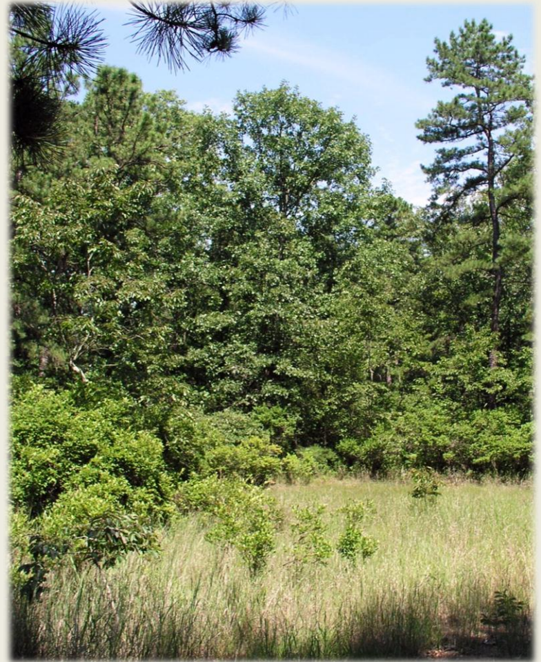
Open field on 699 acre Cologne Avenue property