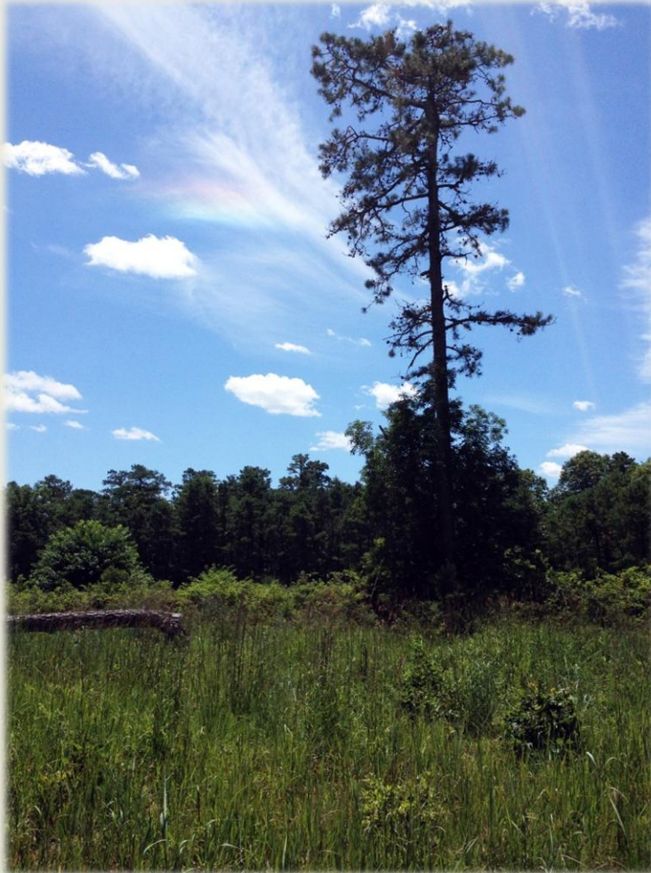
Open field on the 2,762 acre Lenape Farms property Estell Manor City, Atlantic County